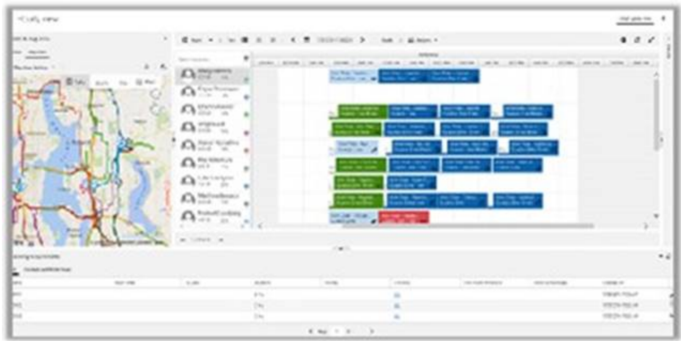
Box 2: Azure IoT Central connector

Azure IoT Central makes it easy to connect, monitor, and manage your IoT devices at scale. With the IoT Central V3 connector, you can trigger workflows when a rule has fired, and take actions by executing commands, updating properties, getting telemetry from devices, and more. Use this connector with your Azure IoT Central V3 application. This connector is available in the following products and regions: